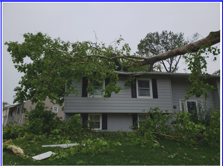
This is Not a typical "Tree House" This is a Sycamore Tree ON a House Cari's house in Cedar Rapids following the derecho