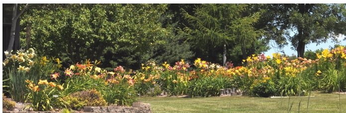
Guess Who's Garden

It is not too early to decide to host a CVIDS Open Garden in 2021. The Open Gardens in 2020 were well attended and a welcome opportunity to see our daylily friends in person. If you want to host in 2021, you will need to send me the date(s) you want guests, the rules (masks or not), your name, address, directions and open times. A short description is nice too.